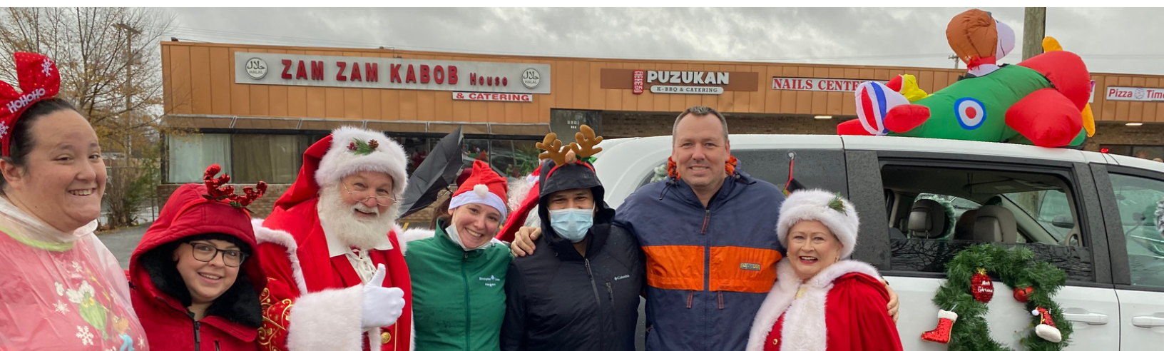
Birmingham Green is proud to have participated in this year's Greater Manassas Christmas Parade. We even took home the prize of Second-Best Business Vehicle.