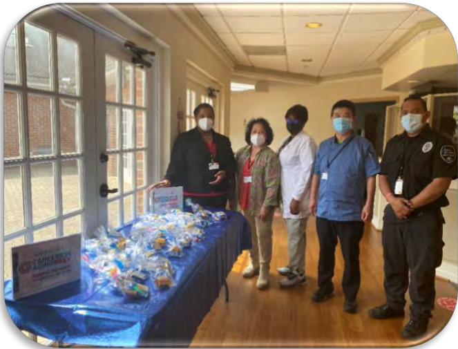
Birmingham Green team members celebrating the diverse careers in aging