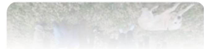
Birmingham Green team members enjoying the sun following their Eden Alternative Training